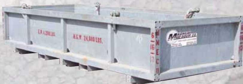
6' x 16' EMPTY WEIGHT: 4,200 lbs. MAX GROSS WEIGHT: 24,800 lbs.