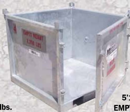
MINI TRANSPORTER 5'10" L x 5'10" W x 5' H EMPTY WEIGHT: 2,350 lbs. MAX GROSS WEIGHT: 10,000 lbs.