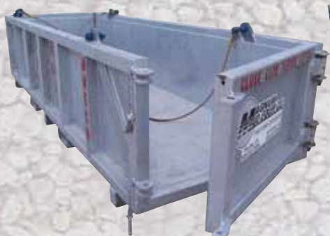
4' x 16' EMPTY WEIGHT: 3,900 lbs. MAX GROSS WEIGHT: 12,000 lbs.