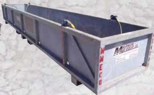
4' x 24' EMPTY WEIGHT: 4,300 lbs. MAX GROSS WEIGHT: 13,000 lbs.