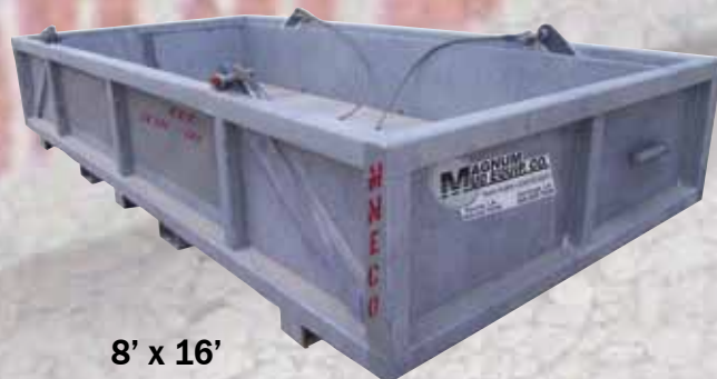
8' x 16' EMPTY WEIGHT: 6,000 lbs. MAX GROSS WEIGHT: 26,500 lbs.