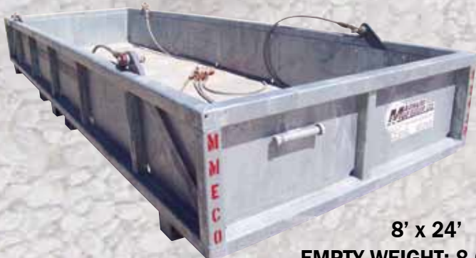
8' x 24' EMPTY WEIGHT: 8,600 lbs. MAX GROSS WEIGHT: 40,000 lbs.