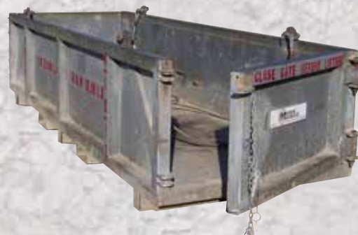
4' x 12' EMPTY WEIGHT: 2,500 lbs. MAX GROSS WEIGHT: 12,000 lbs.