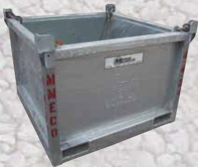
4' x 4' EMPTY WEIGHT: 1,220 lbs. MAX GROSS WEIGHT: 6,000 lbs.