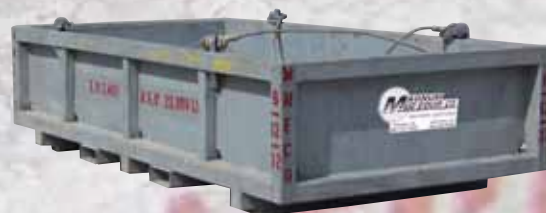
6' x 12' EMPTY WEIGHT: 3,400 lbs. MAX GROSS WEIGHT: 23,800 lbs.