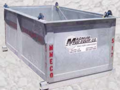
4' x 8' EMPTY WEIGHT: 2,050 lbs. MAX GROSS WEIGHT: 12,000 lbs.